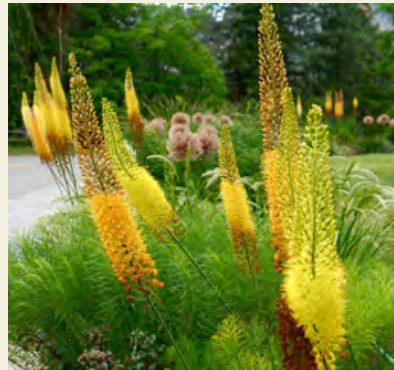
Foxtail lilies (Eremurus spp.) in our new Crescent border

Summer has arrived and we are well into another heat wave. The Gardens have many mature trees that provide shade to sit and enjoy the view or to picnic. What a wonderful place to escape the heat. We encourage you to bring friends and family here during the summer months.